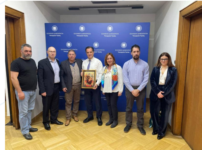
HEFAA Board meeting with the Greek Minister of Health, January 2024